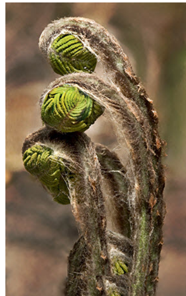
"The Three Wise Men" by Sherrill Bower