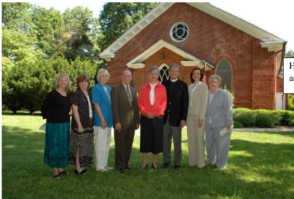
Holy Trinity's School and Church Leaders