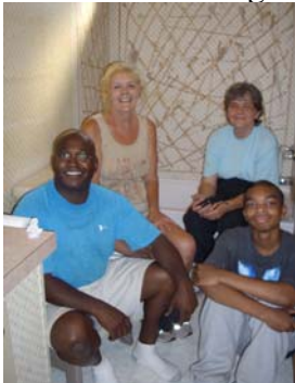
Left: Bathroom remodel team with Southwestern Virginia mobile homeowner.