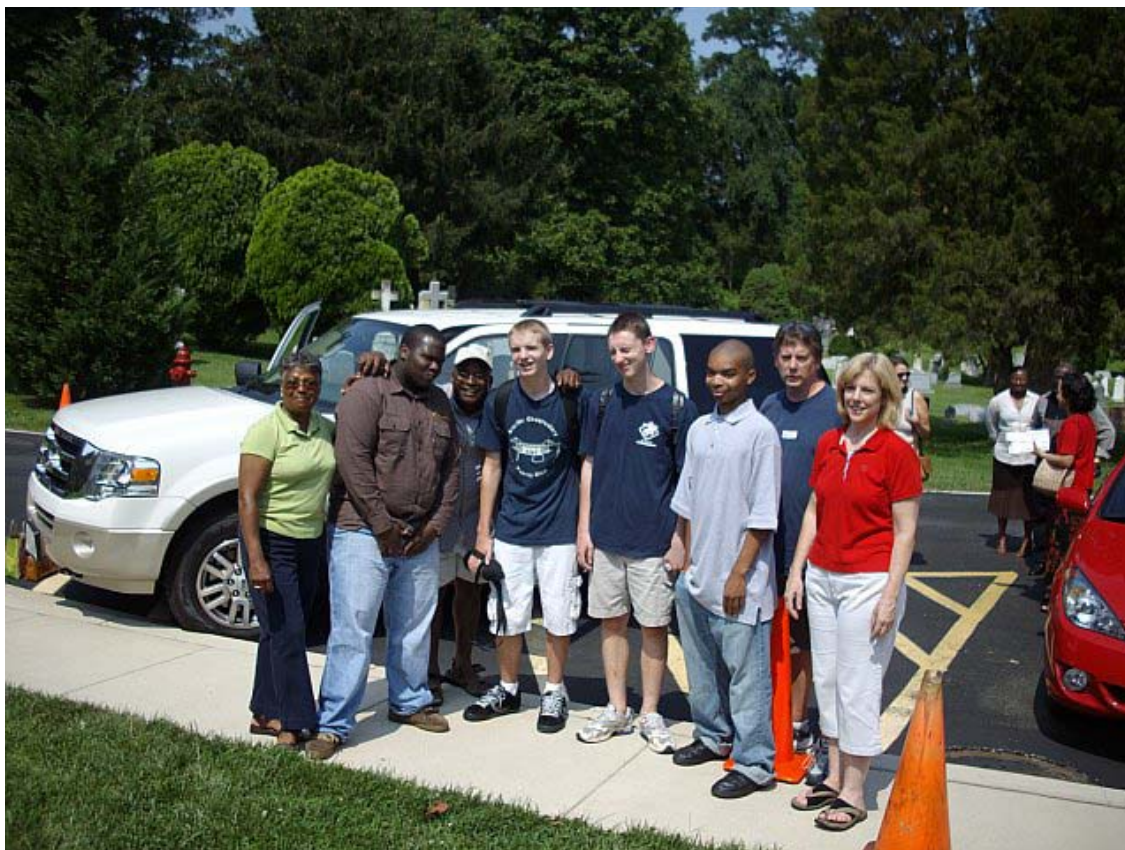
Holy Trinity Youth and Adults on Mission Trip to Southwestern Virginia

Holy Trinity's Mission: Building an open community that connects people to God and their ministries.