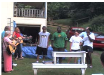
Right: Workers chill out while listening to bluegrass.