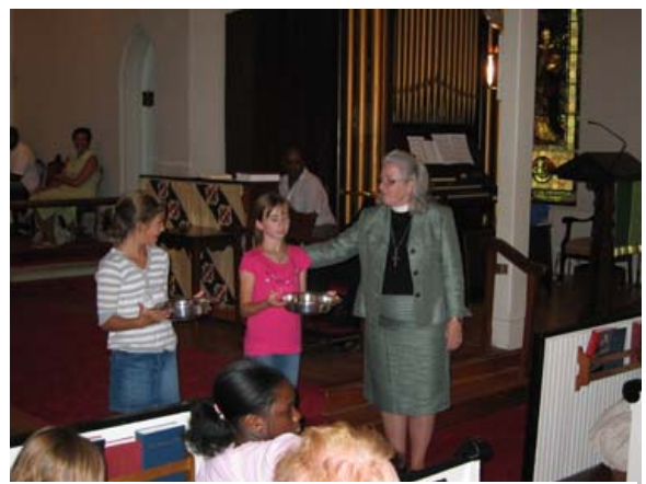
Acolytes practicing for Sunday Worship

Keep watching the services to see where and what the changes are. I hope that the changes will be subtle, a little tweak here and a small nudge there. I assure you that the changes are being done prayerfully so as to create the best space we can for our Sunday encounters with God. I also promise you that nothing we change is set in stone, so if you don’t like something or wonder about something and especially if you do like something, please speak up!